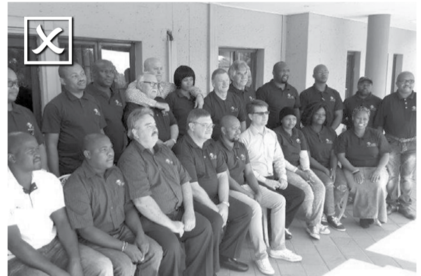
The two photos above a show the difference between good and bad compositions e.g. look you subject in the eye, move in close.