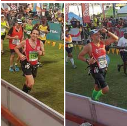
(Above): At the Comrade's finish line.